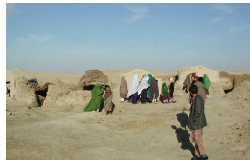
In photo: Village in Northern Afghanistan

15. Under the Taliban regime, women and girls are treated as second-class citizens and Christians are considered to have no value. The abhorrent result of this extreme discrimination is that many women are forced into sexual slavery. Pray for an end to these evil practices and for repentance