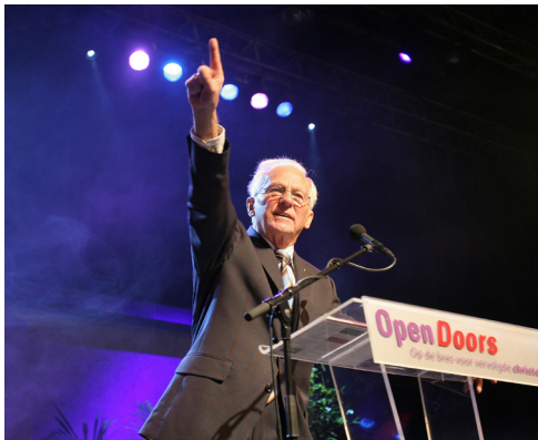
Brother Andrew, 1928-2022