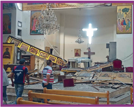
Mar Elias Church, in the Dweila area of Damascus, Syria, after the devastating bomb attack. 22 Christians lost their lives.