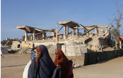
In photo: Women in front of war-damaged building in Somalia

14. Somalia: Somalia has ranked near the top of the World Watch List for years. Pray for believers who risk everything to follow Jesus, that they would have the perseverance to continue to live for Christ in such a hard place.