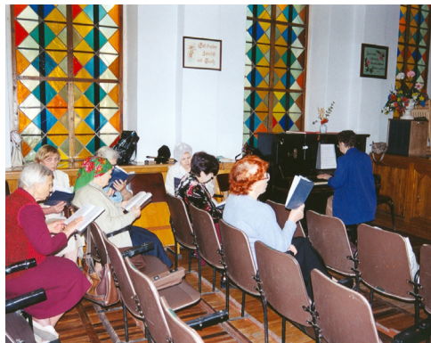
In photo: A church in Uzbekistan

23. Pray for Christians who have been victims of police raids. Pray that they would be protected and would have the courage to continue to worship together.