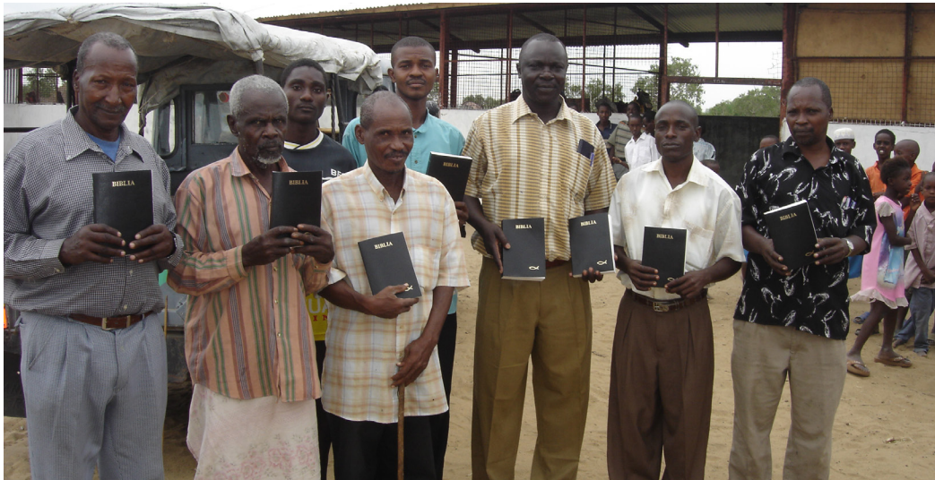
In photo: Bible distribution in Kenya

11. Myanmar: Thank God for the courage of Christians who continue to follow Jesus even after the military coup two years ago. Ask Him to