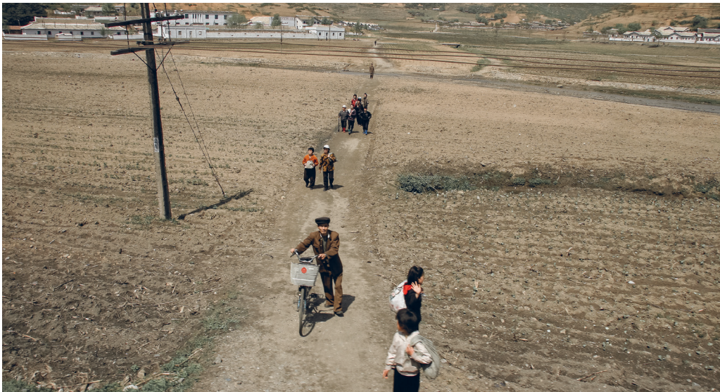
In photo: Local village in North Korea

6. Propaganda in North Korea teaches children that Western missionaries kidnap and kill people. Pray for these children to meet Jesus authentically, and encounter kind, genuine