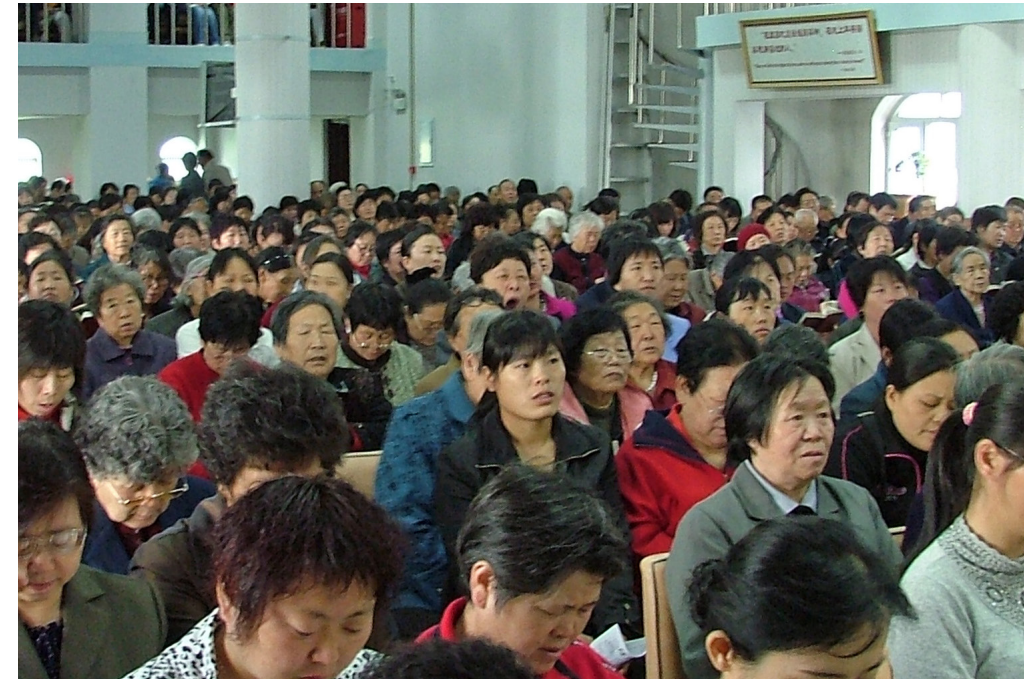
In photo: Church service in state approved Three Self Church in Urumqi, capital of Xinjiang Province, China.