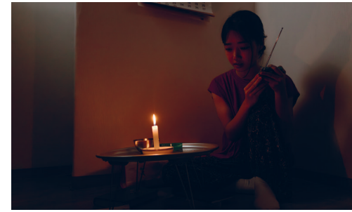
In photo: North Korean teen listening to Christian radio

Christians to show them God's love for them.