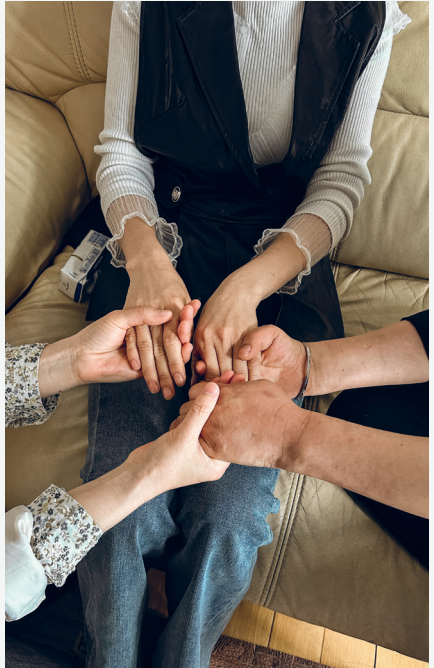
North Korean Christians